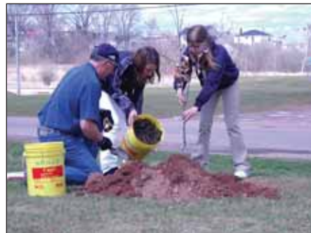
Students at Salem Elementary School plant trees on Arbor Day, with the help of a local volunteer.

Marshview Middle School continues the Early French Immersion program for students from grades five to eight. In addition to its gymnasium, cafeteria, library, and games room, the school has a fully equipped lab of networked computers. 365 students attend Marshview.