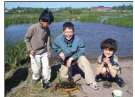
Students enjoy the environmental activities at the Tantramar Wetlands Centre, at Tantramar Regional High School.

Tantramar Regional High School is well known throughout the province for its strong academic program and the quality and variety of its extracurricular activities. The school offers advanced courses in English, math, and chemistry and continues the early French Immersion program.